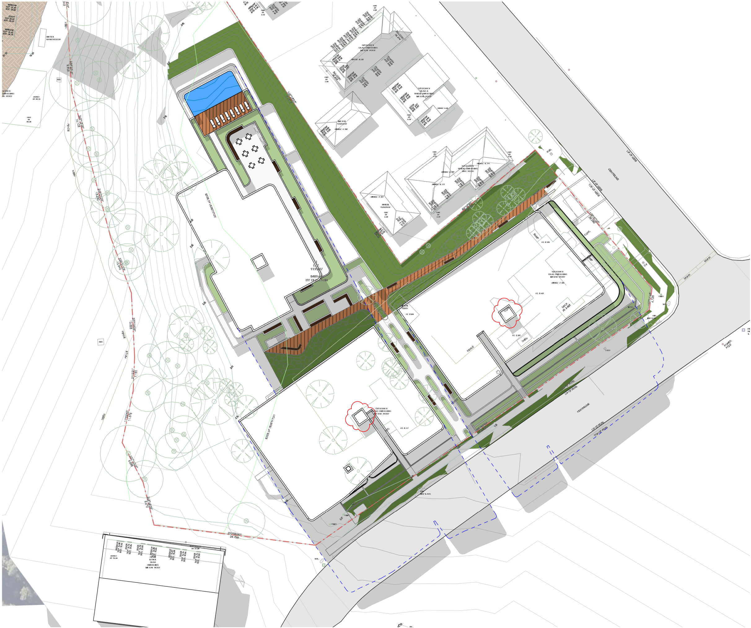
SHADOW STUDY - PROPOSED - 21 JUNE 3PM 1 : 500