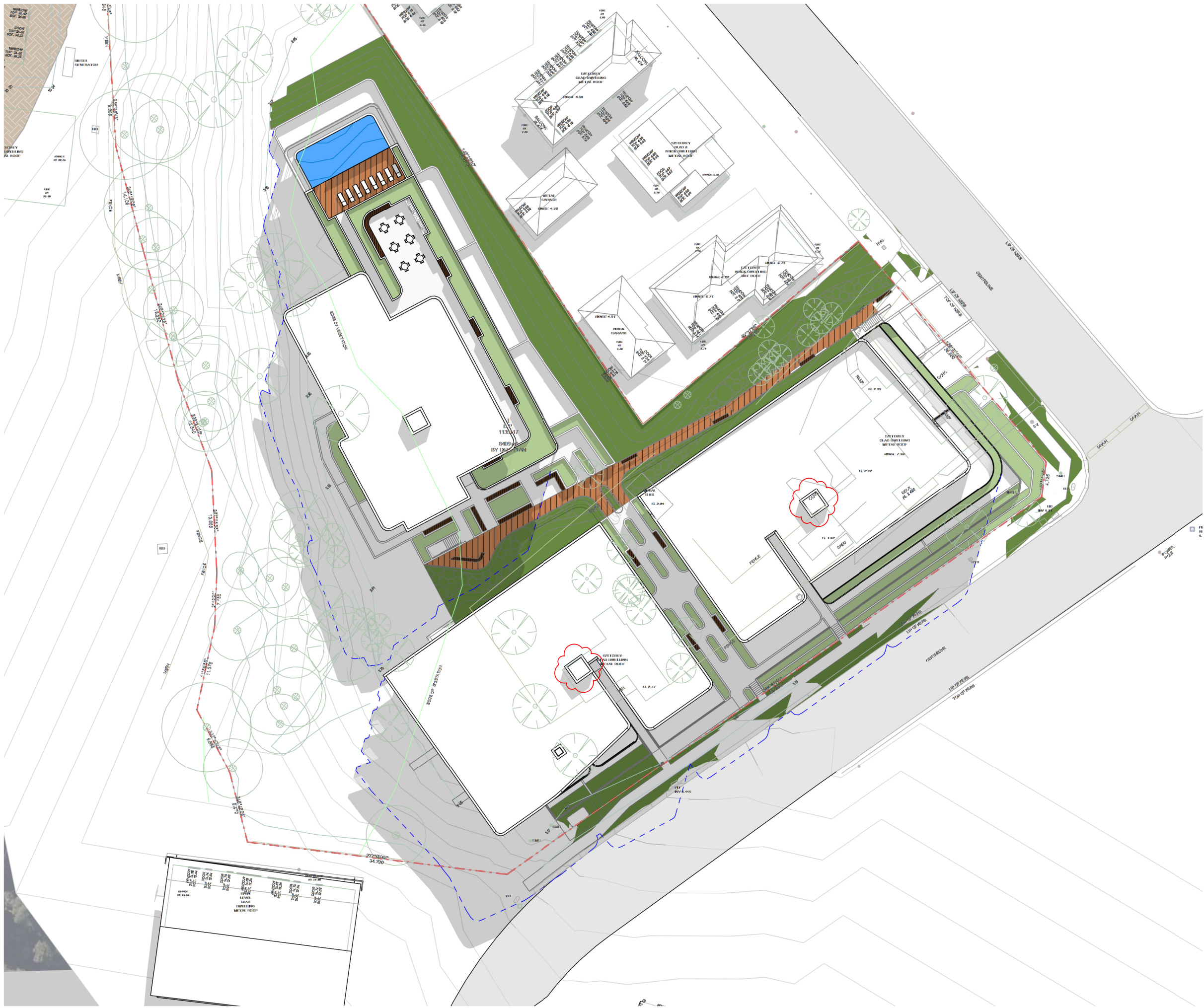
SHADOW STUDY - PROPOSED - 21 JUNE 12PM 1 : 500