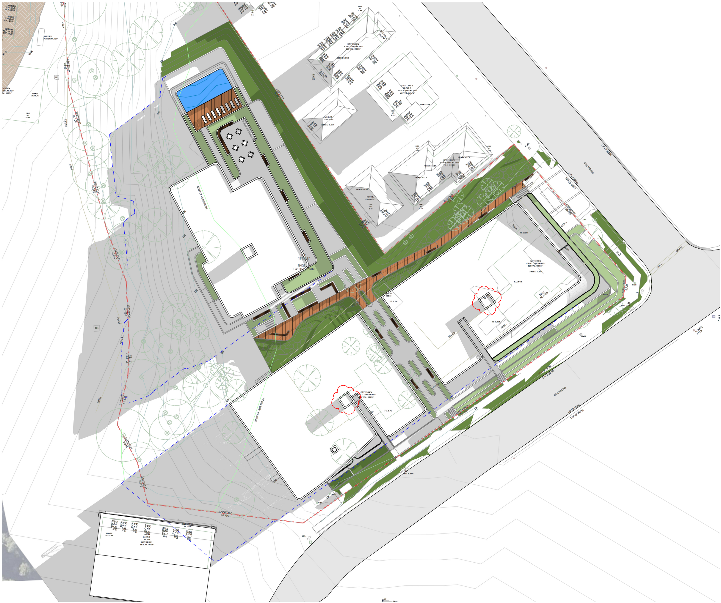
SHADOW STUDY - PROPOSED - 21 JUNE 9AM 1 : 500